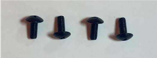
4 x Screws