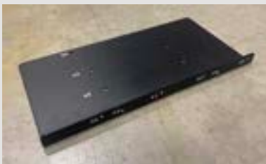
1 x Security Bracket