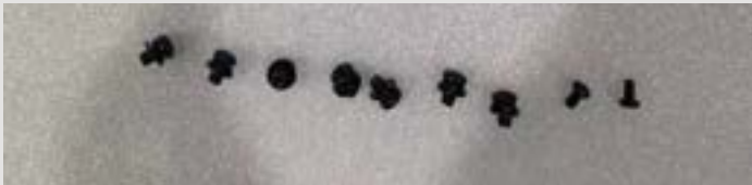
9 x Small Screws