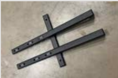
1 x Security Frame Arms