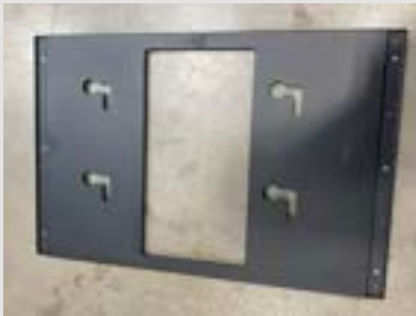
1 x Wall Mount